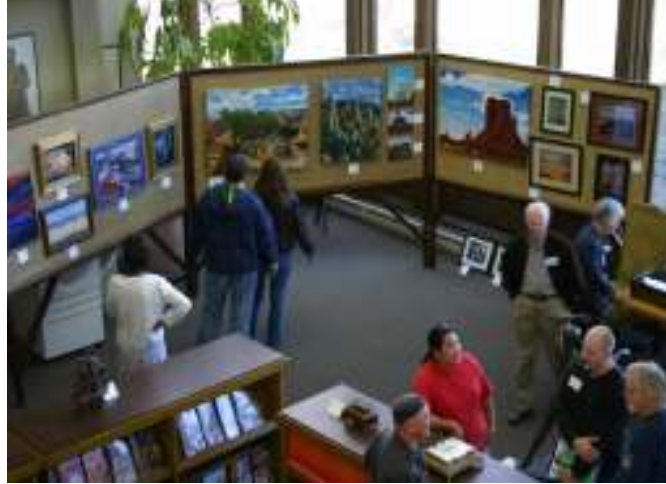
The Fine Arts Festival Gallery in the Phillips Library

The Fine Arts Festival has been kept alive and strong for forty three years. We are very proud of this great Orme tradition. It is arguably one of the best weeks of the year, one etching positive memories that Orme students carry forward in their lives. The Festival is a week of total immersion in the Arts. From January 24th through the 29th, each student will take a workshop with a professional artist for five hours a day, and every evening they attend an art performance. The week culminates on Saturday the 29th with Grandparents Day and Alumni Open House when we are joined by family and friends who come to see exhibitions of the students' work and performances by drumming, music ensemble, dance, and video production workshops. Before Winter Break students sign up for three choices of workshops. They are assigned to one using a point system based on their grade level, number of years at Orme, and participation in the student Fine Art Festival Committee.