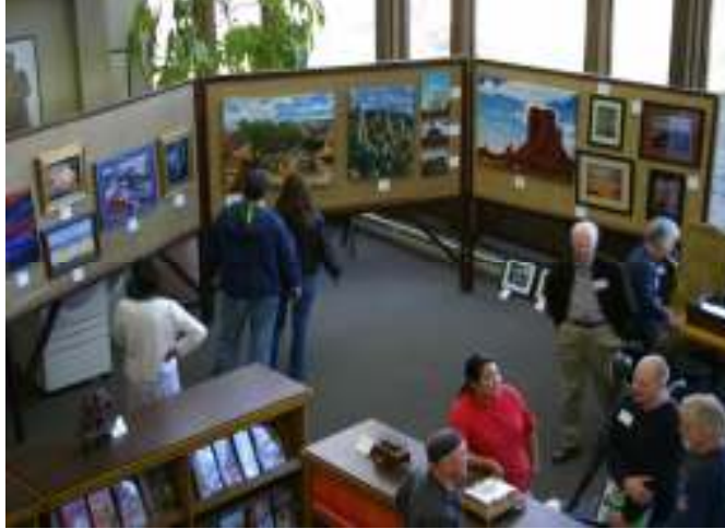
The Fine Arts Festival Gallery in the Phillips Library

The Fine Arts Festival has been kept alive and strong for forty two years. We are very proud of this great Orme tradition. It is arguably one of the best weeks of the year, one etching positive memories that Orme students carry forward in their lives. The Festival is a week of total immersion in the Arts. From February 1st through the 6th, each student will take a workshop with a professional artist for five hours a day, and every evening they attend an art performance. The week culminates on Saturday the 6th with Grandparents Day and Alumni Open House when we are joined by family and friends who come to see exhibitions of the students' work and performances by creative writing, drumming, music ensemble, dance, and video production workshops. Before Winter Break students sign up for three choices of workshops. They are assigned to one using a point system based on their grade level, number of years at Orme, and participation on the student Fine Art Festival Committee.